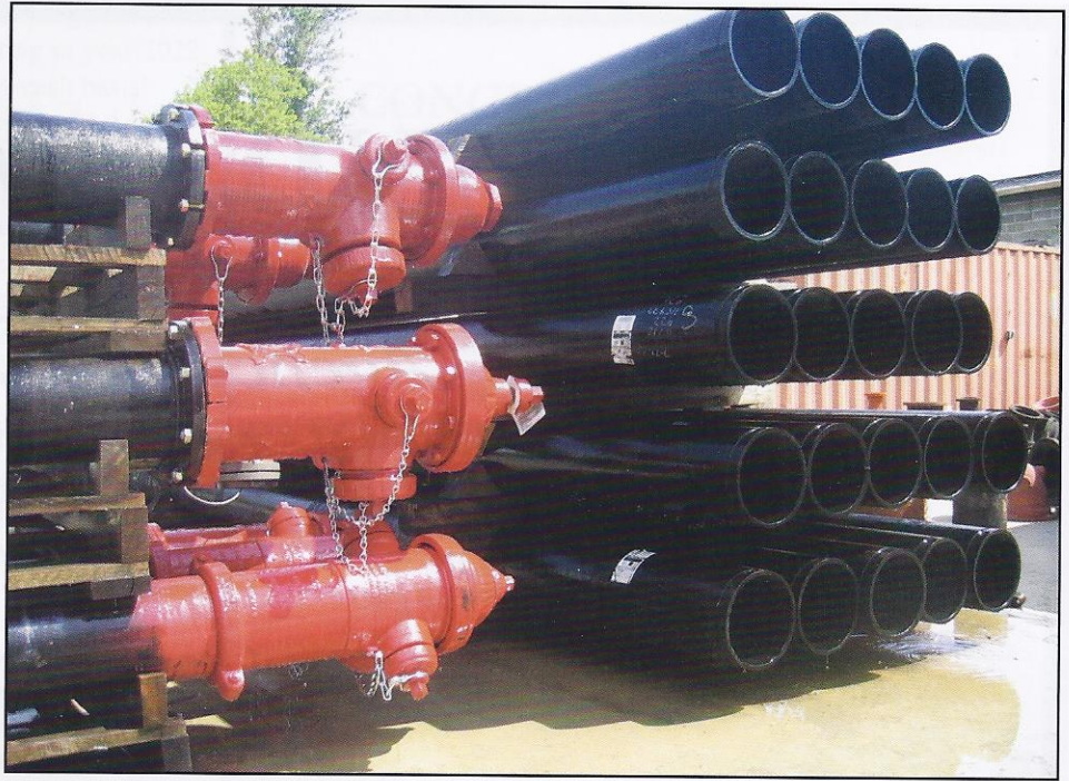
Some of Raritan's supply of hydrants and pipe are pictured in the firm's yard.